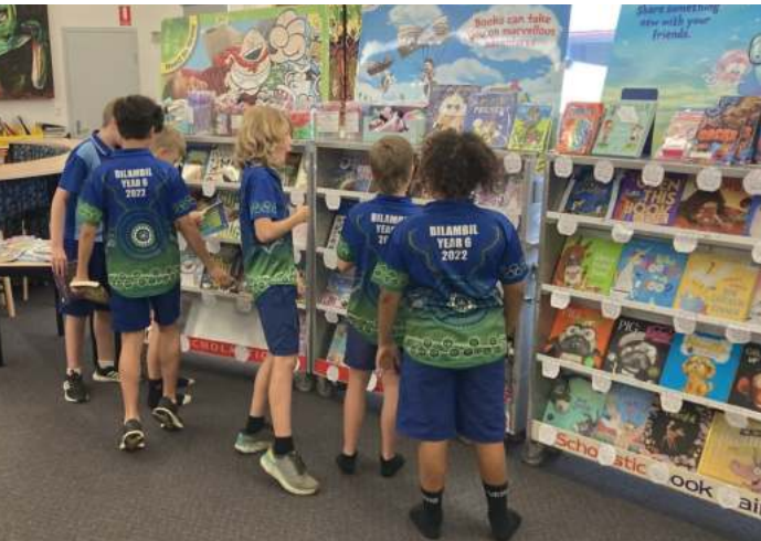
6B is enjoying their library session