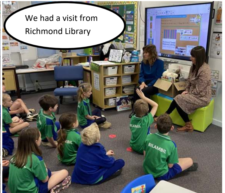
We had a visit from Richmond Library