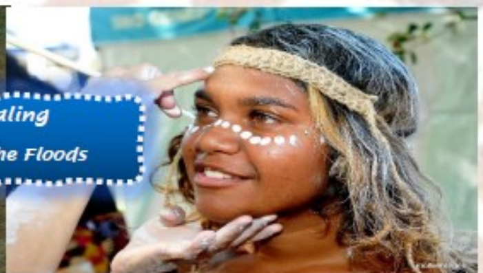
Healing After the Floods

Free children's nature crafts and activities all day