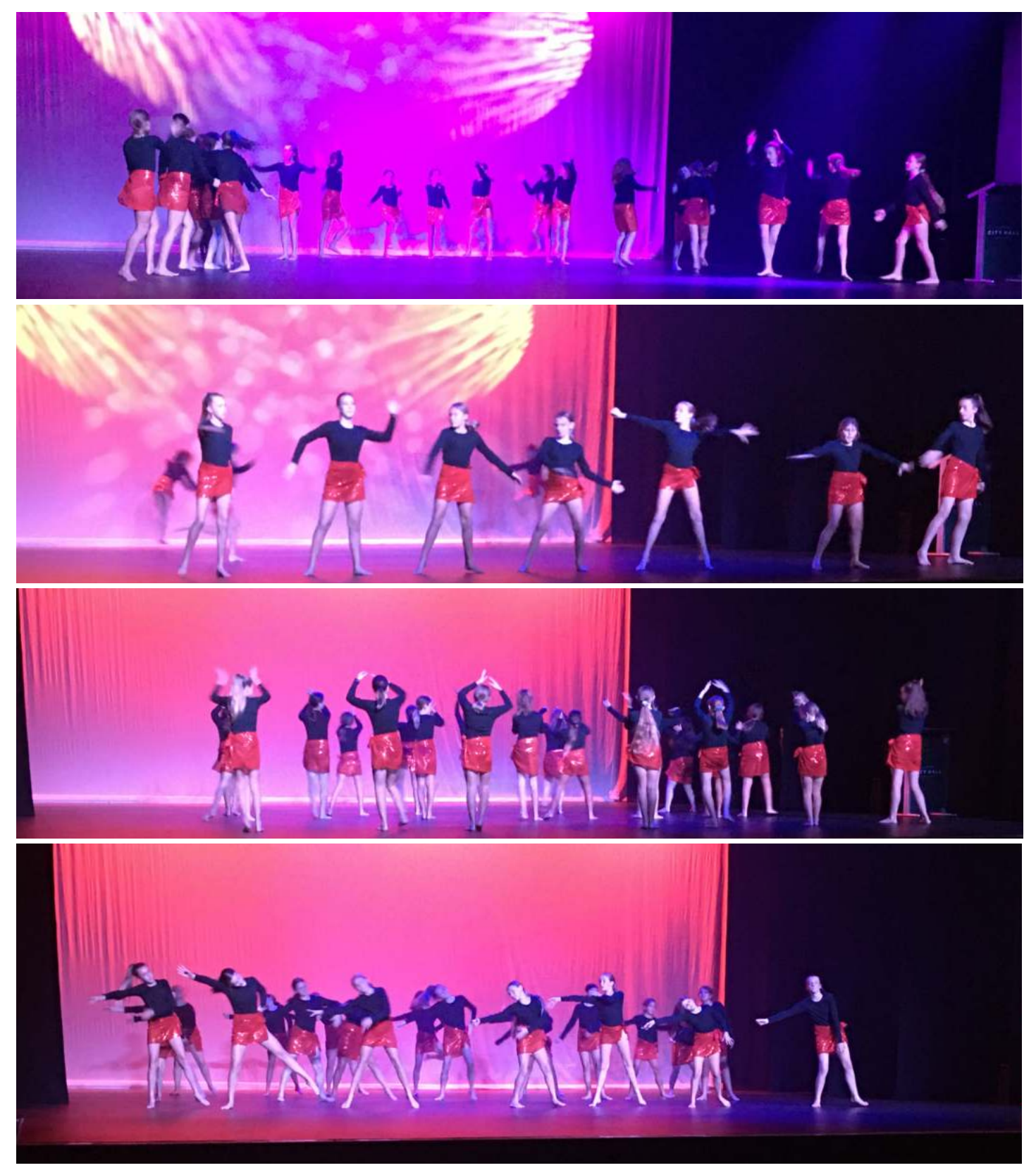
ALL THE PRACTICE HAS PAID OFF, WELL DONE BILAMBIL FNC TEAM!