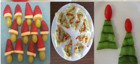
Festive Food for the Christmas period! We encourage healthy snacks as part of Christmas celebrations