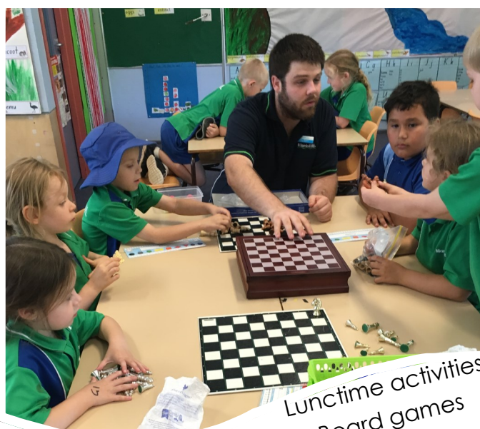
Luncheon activities Board games