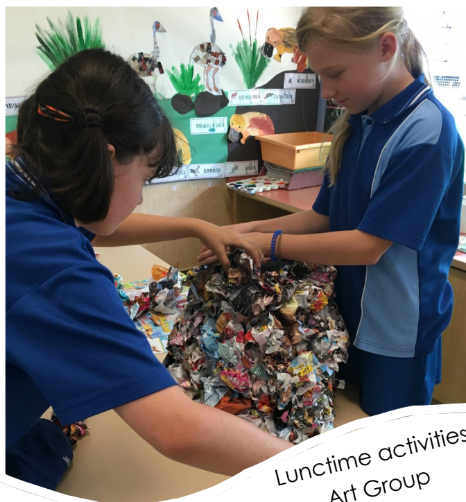
Luncheon activities Art Group