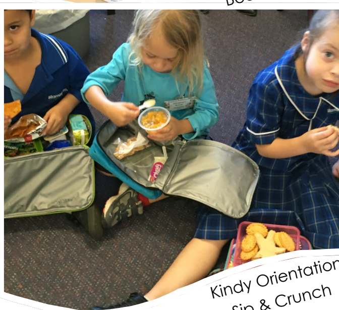
Kindy Orientation Sip & Crunch