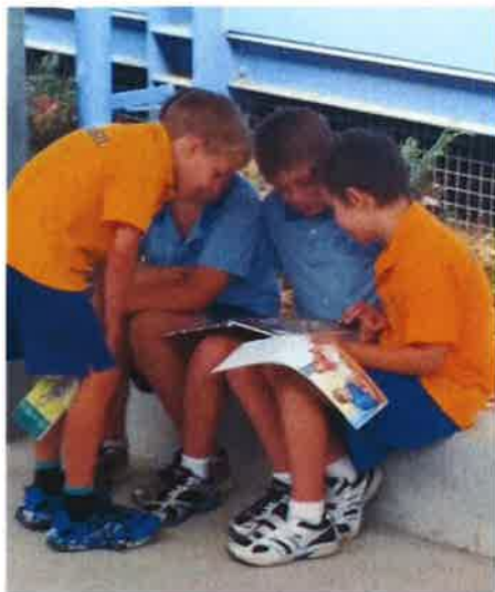
Buddy Reading with 3/4M