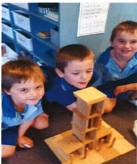
How high can they go!