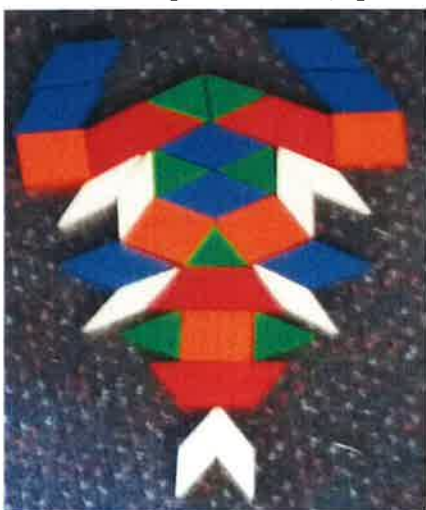
Having fun with the fundamentals of symmetry and design